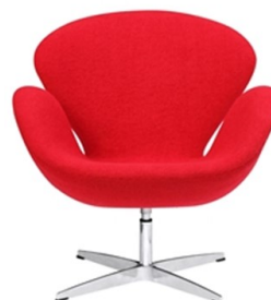
Red Swan Chair