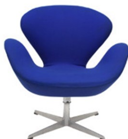
Blue Swan Chair