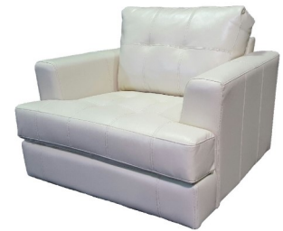
Contemporary Ivory Chair