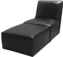
Armless Lounger (Armless Chair & Ottoman)