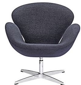
Grey Swan Chair